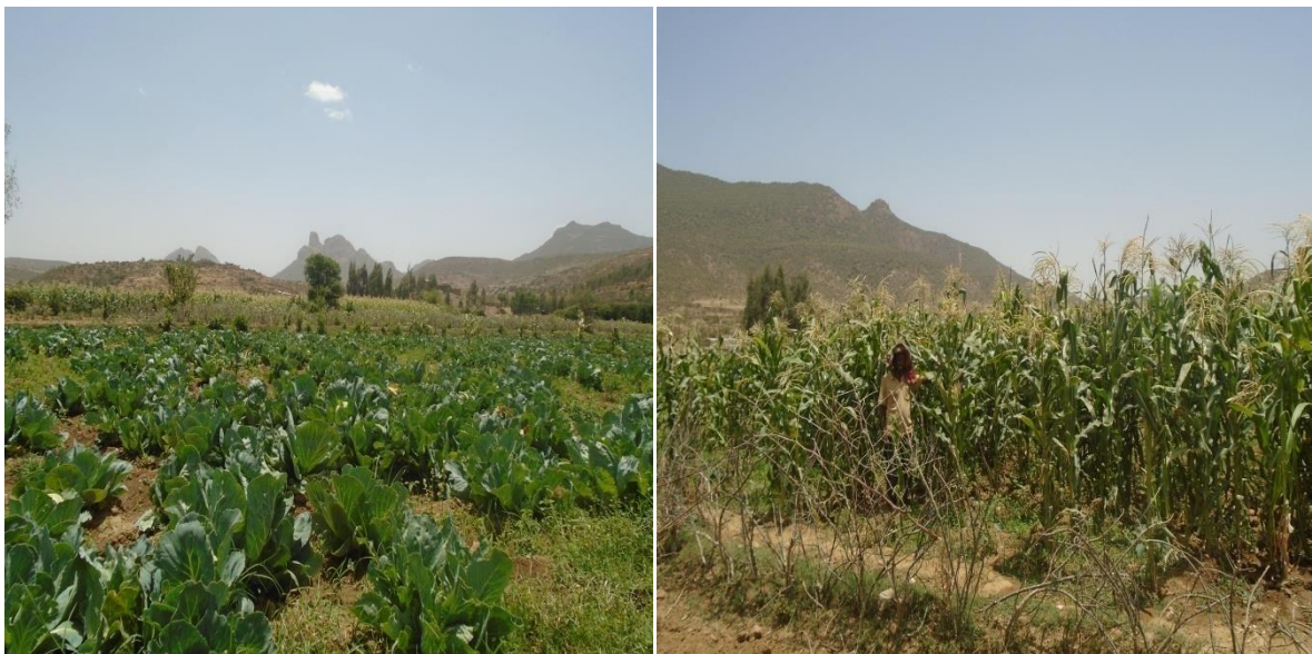
Figure 3: Irrigation Practices in 'Enabered' Watershed April, 2018

in the study area are motor pump from a shallow well and gravity irrigation. Ato Tsegay Kinfe is a farmer in Enabered produce crops (Maize) and vegetables using irrigation practices (Figure 3). He said the irrigation saved from migration to Western Tigray in search of job. Because irrigation access increase in the watershed and practices in the irrigation field. He used motor pump for irrigation water.