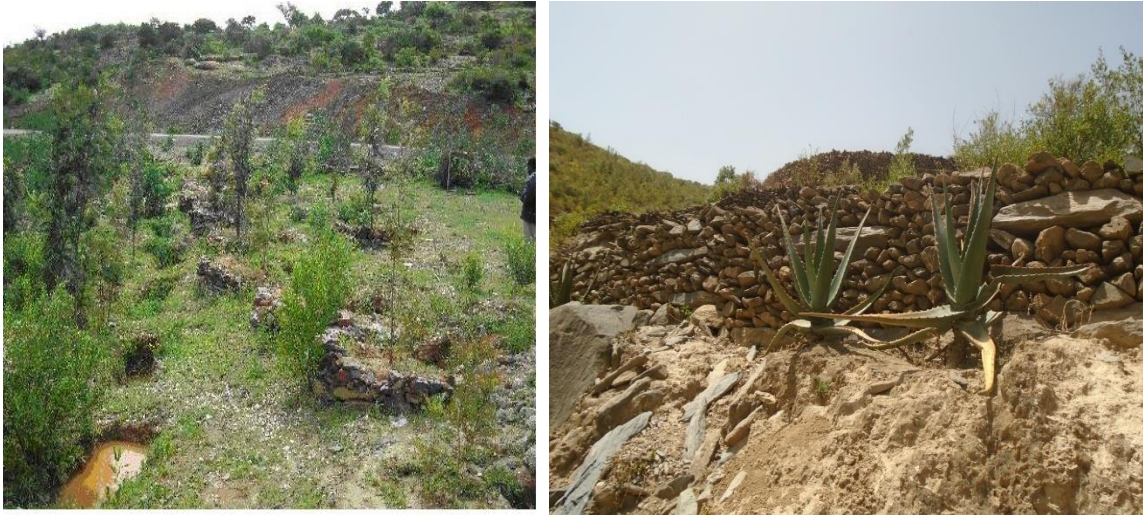
Trenches, half moons and terraces in Enabered watershed