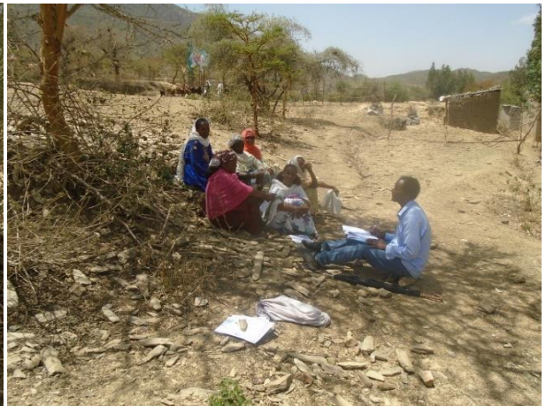
Elder male group and medium age female group discussions