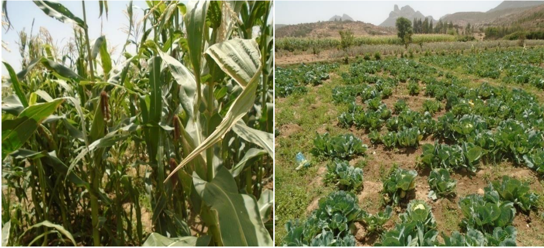
Irrigation practices in Enabered watershed April 2018